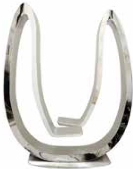
CONVERSATION Polished Stainless Steel By Guillaume Piechaud