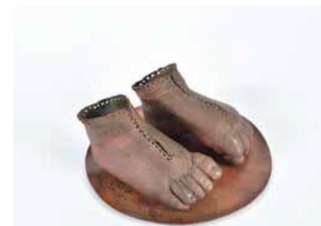
HOMMAGE À MAGRITTE Copper, Brass By Claude Lalanne