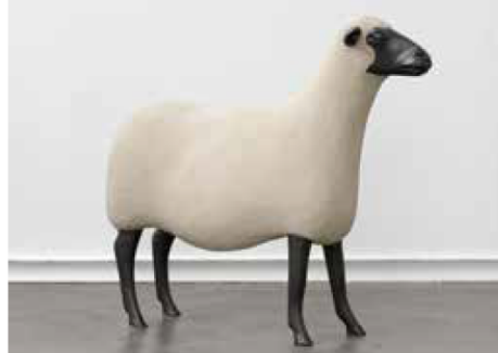
LES NOUVEAUX MOUTONS Brebis, Bronze and Epoxystone By Francois-Xavier Lalanne