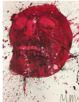
SKULL Mixed media on paper By Philippe Pasqua