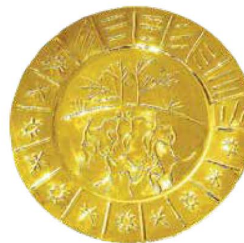
JOIE DE VIVRE Gold Plate, 23cts By Pablo Picasso